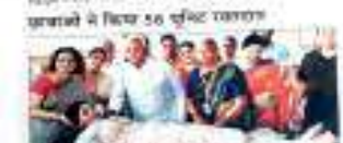
प्रभाजो में विद्यार्थी 50 प्रतिशत तकताम