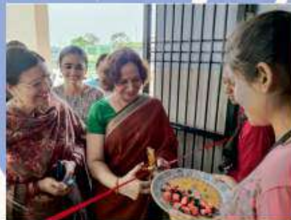
Zero Discrimination Day March 01,2024