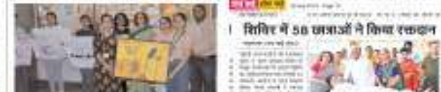
सिचि में 50 छात्राओं ने किताब रचकाव